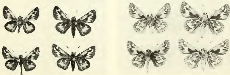
Fig. 3. Dorsal and ventral surfaces of P. s. tecumseh from Donner Pass, California (7,000 feet), July-August.